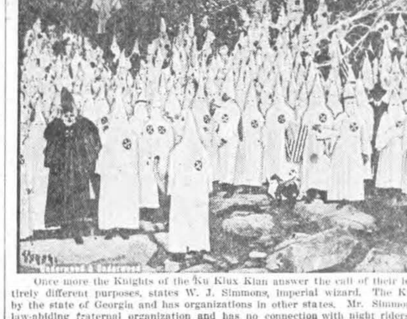
Once more the Knights of the Ku Klux Klan answer the call of their leaders, but now the gatherings are for entirely different purposes, states W. J. Simmons, imperial wizard.

are avalanches, landslides, falling rocks, blizzards, falling ice, falls from precipices or into crevasses, falls from ice slopes or down snow slopes. Some of the notable mountain-climbing peaks of history and the year in which the peaks of the various mountains were attained follows: