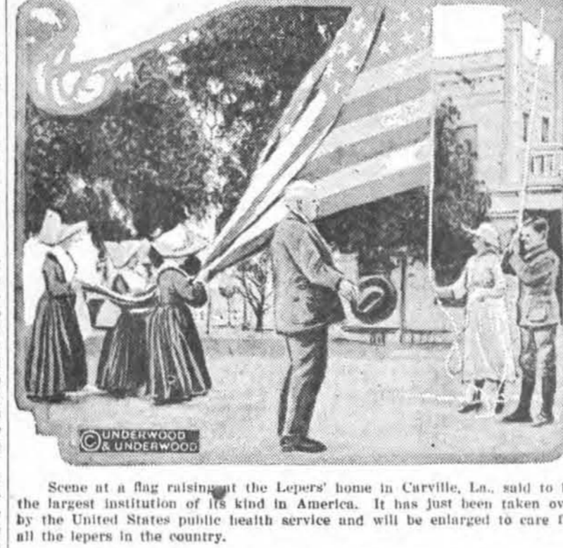
Scene at a flag raising at the Lepers' home in Carville, La., said to be the largest institution of its kind in America.