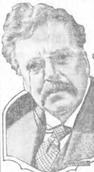
A new photograph of Gilbert K. Chesterton, noted English author.