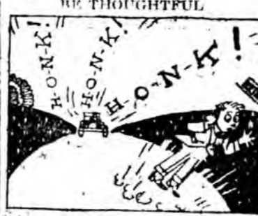
Automobile horns are to warn pedestrians, not to frighten them. Drivers of motor trucks are usually the worst offenders.

LEARN TO PARK CORRECTLY When leaving your car, stop the motor, set the emergency brakes and lock it. Leave your car with its right side parallel and close to the curb or roadside.