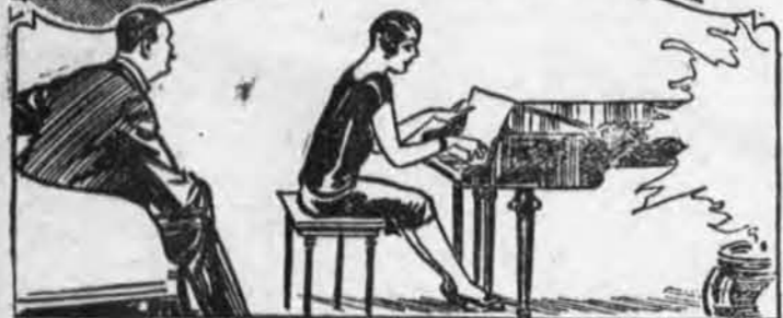
THE "KING OF JAZZ" IS IMPRESSED WITH THE NEW PIECE OF MUSIC