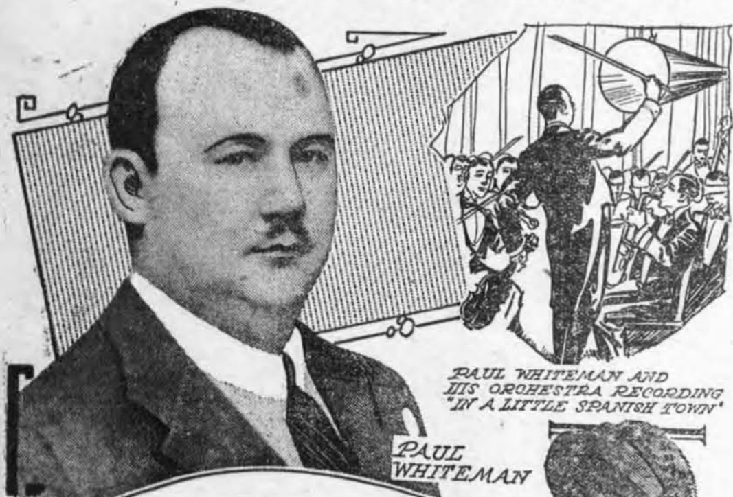
PAUL WHITEMAN AND HIS ORCHESTRA RECORDING "IN A LITTLE SPANISH TOWN"